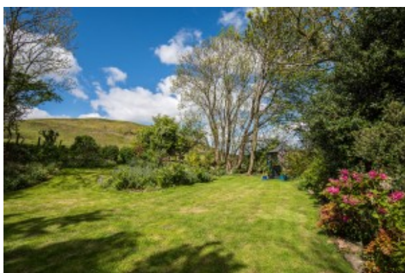
Our back garden

Humbleton Hill provides a great leg stretching walk not far from the cottage. The beaches of Northumberland's coast are also popular for dog walking – they are huge, open expanses with shallow surf to run and play!