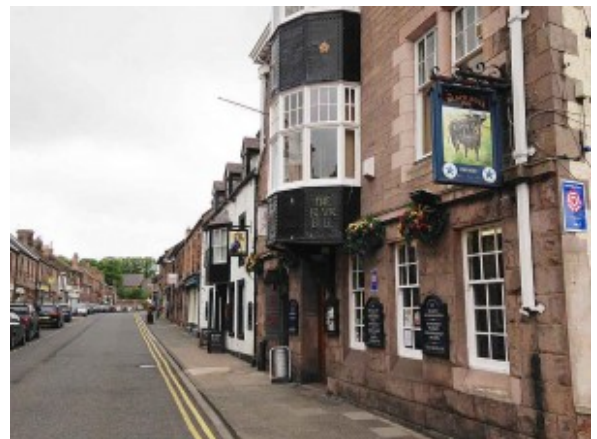
Wooler High Street

Wooler offers all the local amenities one would expect from a market town including a late-opening Co-Op supermarket, banks, deli, Post Office, pharmacy,